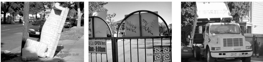
Figure 2. Photovoice images of littering, graffiti, and idling trucks: 1) furniture littered on the street, 2) graffiti on Duc Vien Buddhist Temple, and 3) large truck in neighborhood.