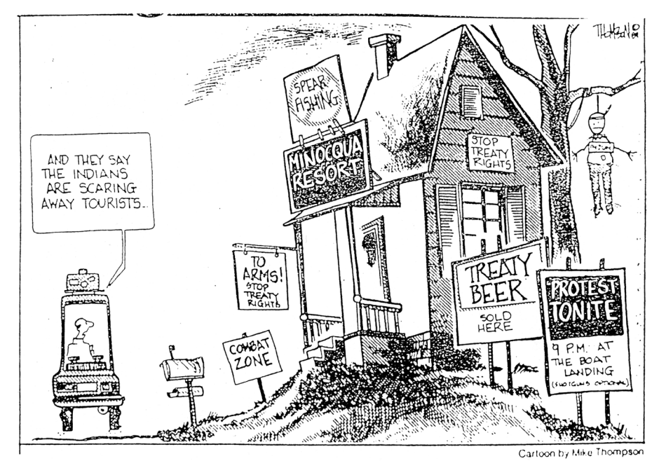
FIGURE 3. Antitreaty protest and regional perceptions. Cartoon by Mike Thompson, Milwaukee Journal, ca. 1988.

In response to the 1983 Voigt Decision and the Ojibwe exercise of their treaty rights in the ceded territory, antitreaty rights groups such as Protect Americans Rights and Resources (PARR) and Stop Treaty Abuse formed and organized large, sometimes violent protests against treaty rights. Protesters threw rocks, screamed racial epithets, and harassed Ojibwe spearers on the water. The majority of the protests occurred in Vilas, Oneida, and Price counties. These counties, studded with lakes and extensive forests, comprise one of northern Wisconsin's prime tourist and outdoor recreation areas. The largest protests were directed at spearers from the Lac du Flambeau Reservation, the most active group of Ojibwe spearers. Protest activities, which attracted national media attention, peaked in numbers and intensity in 1989 and ended in 1992 following the district court's final judgment in the Voigt litigation (fig. 3).<sup>33</sup>