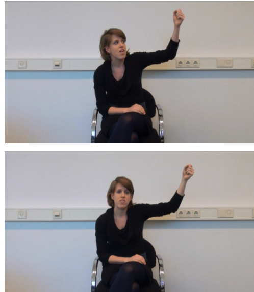
Figure 1. Stimulus movie snapshots. Top: gesture with speaker-gaze. Bottom: same gesture without speaker-gaze.

The gestures in the stimulus movie were taken from previously collected retellings of a Tweety and Sylvester cartoon (Mol, Krahmer, Maes, & Swerts, 2009; Mol, et al., 2011). The speaker in the stimulus movies produced 24 iconic gestures and 10 beats, half of which she gazed at (alternating). The rest of the time, she looked into the