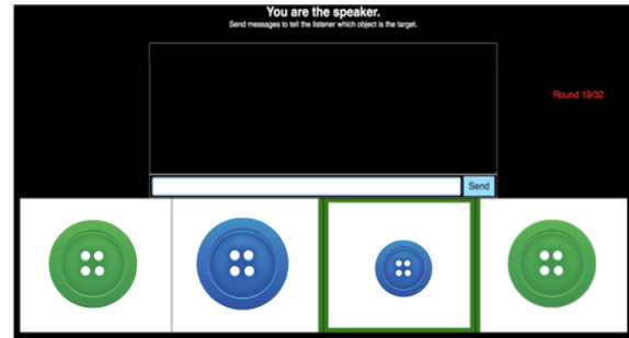
Figure 1: Example display from the director’s display on a size sufficient trial.

There were 30 critical trials. On each critical trial (Fig. 1), the four images were of the same object type, and either mentioning the color or size of the target object was sufficient for establishing unique reference. On 15 color sufficient trials, mentioning size was redundant, because a competitor object shared the redundant feature (size) with the target. Similarly, on 15 size sufficient trials, a competitor had the same color as the target item, making color mention redundant. On each trial, there were two additional distractors that shared the sufficient property with the competitor. All items were normed for object and feature nameability.