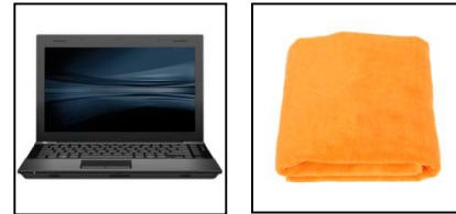
Figure 2: Example of a pair of object pictures.

Prior to testing, all 320 pictures were judged by two raters (female native German speakers who did not participate in the main experiment) for their ease of identification.