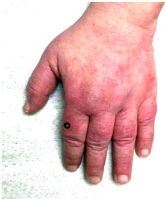
Figure 1. Clinical examination revealing erythema and edema of the left dorsal hand and fingers with biopsy site marked. Similar findings noted on right hand.

Red puffy hand syndrome was first described in 1965 by Dr. Hans Abeles who was Commissioner of Health for the Department of Corrections in New York City [1]. He began noticing contour changes of the dorsal aspects of the bilateral hands in several incarcerated