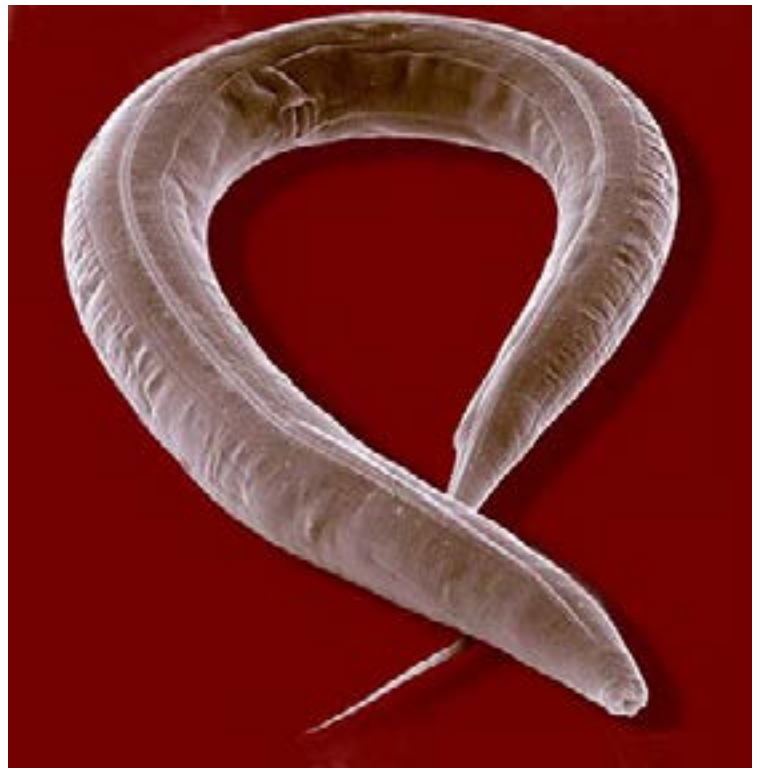
Picture of the nematode