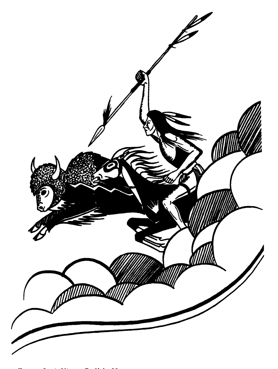
FIGURE 3. A Kiowa Buffalo Hunter.