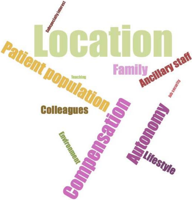
Figure 2. Word cloud illustrating frequencies of driving factors listed by those who entered nonacademic dermatology. The size of the word corresponds to the relative frequency with which it appeared in participants' responses.

At the time of our survey, 37.8% (N = 14) of our graduates described their current practice as academic. One graduate moved from a nonacademic practice to an academic practice and cited family and location as the reasons behind both his initial and current career decisions. Three others transitioned from academic practices to nonacademic practices. Two of these cited the availability of positions after a move as the driving factor for choosing nonacademic practices later in their careers, with one graduate explicitly stating that there was no academic center at his or her new location. Autonomy, compensation, lifestyle, and absence of pressure to publish/obtain grants were also cited as reasons for switching to a nonacademic practice setting.