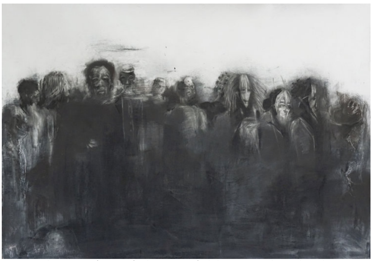
Figure 3 Sydney Cain, Refutations (for those waiting for light), 2019, graphite and metals on paper, 33 x 46 in. (83.8 x 116.8 cm.).

contrast between shadows and highlights throughout the drawing results in figures with partially rendered faces, smudges, lines, and tones of gray (fig. 3). While these figures are only merely suggested, the use of African tribal masks indicate that they belong to the Black diaspora. Working with particles of black dust, Cain illuminates and reveals "those waiting for light," or rather the spirits hidden within the voids of our own world.