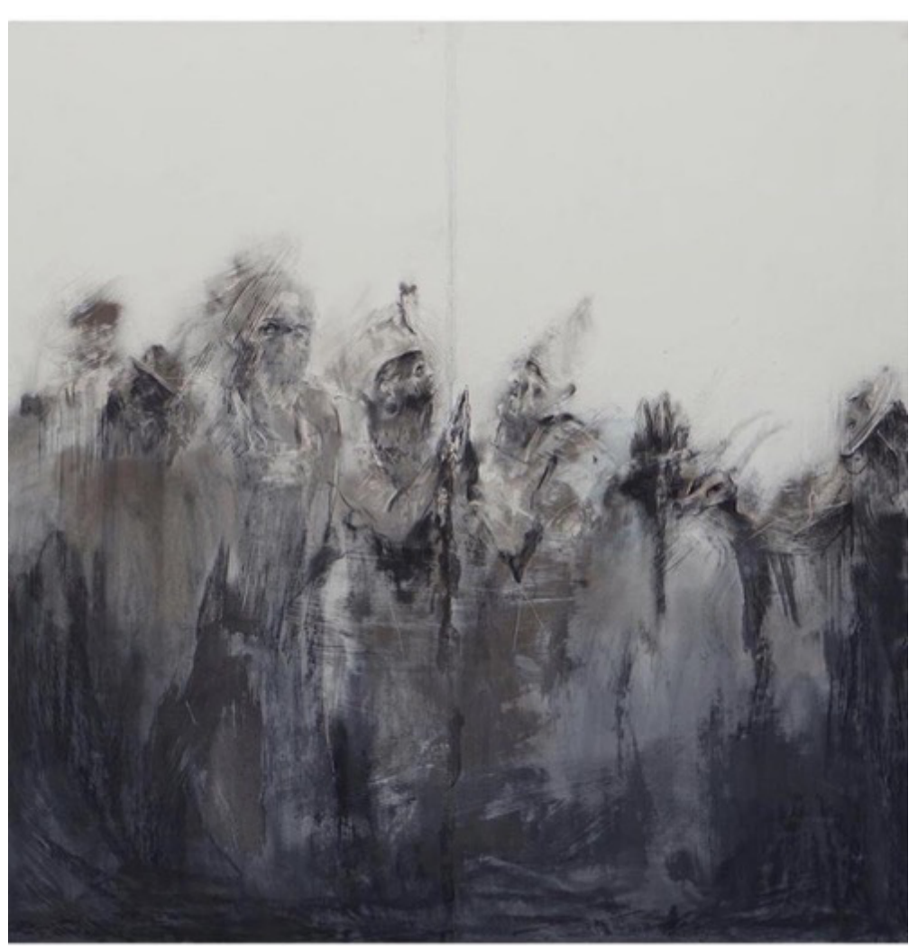
Figure 4 Sydney Cain, Refutations (After everything spills through the seams), 2020, powdered metals on wood, 48 \times 48 in. (121.9 x 121.9 cm.).

Similarly to Black artists and scholars who cultivate their own practices for engaging the deceased and dispossessed across histories of the African diaspora, Cain refuses to see the past as static or resolved. Although Cain's work is a response to the anti-Black present of Bay Area gentrification and erasure, the spiritual communions depicted in Refutations are not melancholic or mournful. Rather, they visualize tender reunions and interactions that insist on the presence and dynamism of past peoples and stories. These works and the audience's engagement constitute a liberated consciousness, where one distances themselves from linear conceptions of time and space, life and death. Ultimately, the refusal to declare the past as disconnected from the present and future ruptures the linear regime of anti-Blackness.