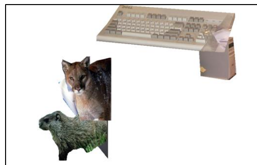
Figure 1. An incoherent scene generated by SOILIE for the query ‘mouse,’ containing elements from both the computer and animal senses of ‘mouse.’

Recent research in cognitive neuroscience supports this co-occurrence view. Under the title of “scene construction theory,” this research has demonstrated that the hippocampus plays a primary role in the construction of a “coherent spatial context” for the integration of the components of imagined experiences among other cognitive phenomena (Hassabis & Maguire, 2007; Maguire & Mullally, 2013). Parallel research on the role of the hippocampus in the emergence of conceptual knowledge and knowledge transfer (see Kumaran, Summerfield, Hassabis & Maguire, 2009) endorses the “memory space” hypothesis of hippocampal function. In this view, neurons in the hippocampus encode the co-occurrence of the components of a given experience or event through their spatiotemporal associations (Konkel & Cohen, 2009). This means that objects can co-occur as a consequence of associations due to spatial relationships (e.g., mice often are seen next to cheese) or temporal relationships (e.g., gunshots are often followed by death or injury). We only address the former in the current work.